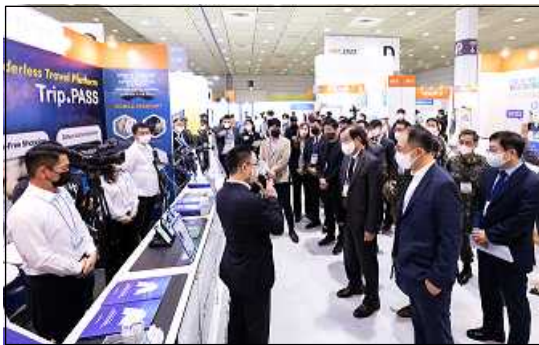
VIP Booth Tour-3