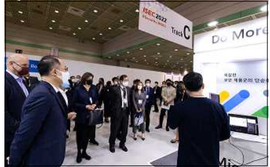
VIP Booth Tour-2