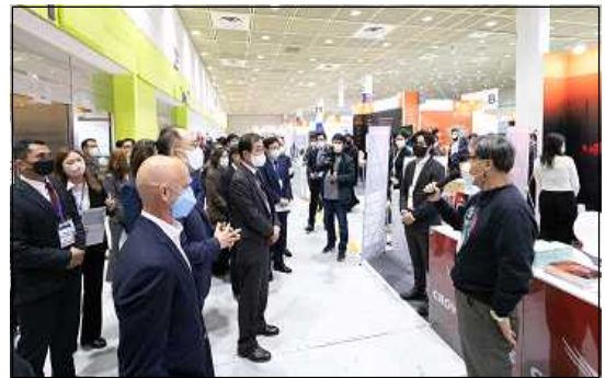
VIP Booth Tour-4